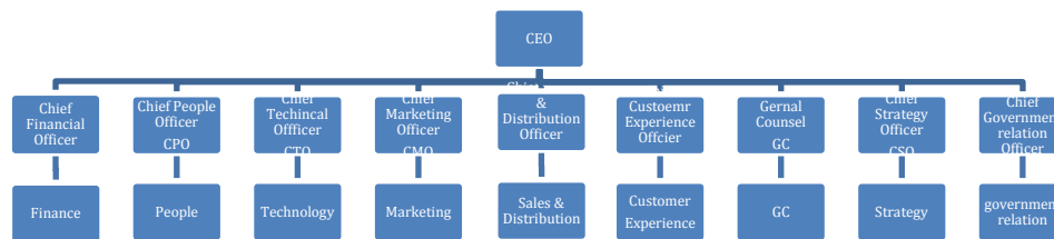
Table 9: Nawras organisational structure